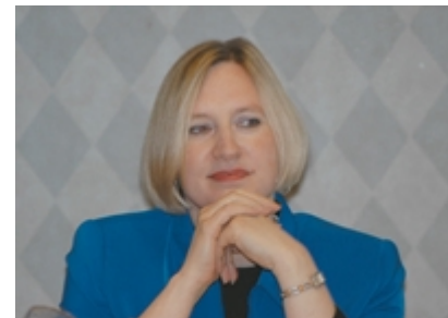
Elizabeth Spehar, Director, Unit for the Promotion of Democracy, Organization of American States

Progress can be made through a refinement in our understanding of the key components of democracy, and by promoting more research on effective democracy promotion and institution building. One way to encourage a positive evolution of the Charter is to develop an evaluation mechanism to assess progress in implementing the goals of the Charter. To track progress, one participant suggested the introduction of a multilateral evaluation mechanism similar to the consensus based recommendation system used to track progress in the fight against drugs and corruption (the MEM). Some participants felt that the Charter would also benefit from an external evaluation mechanism, to eliminate the political constraints of the Member States of the OAS.