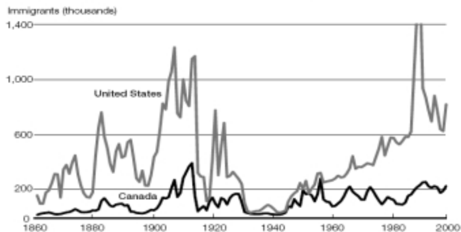
Immigration to the United States and Canada, 1860-2000

Sources: U.S. Immigration and Naturalization Service, Annual Statistical Yearbook ; and Citizenship and Immigration Canada ( www.cic.gc.ca , accessed Jan. 9, 2002).